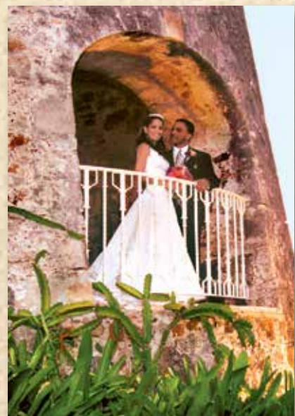
The Buccaneer, St. Croix