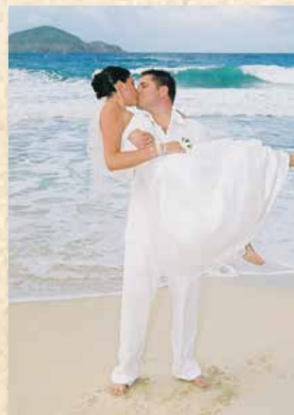
Magens Bay, St. Thomas