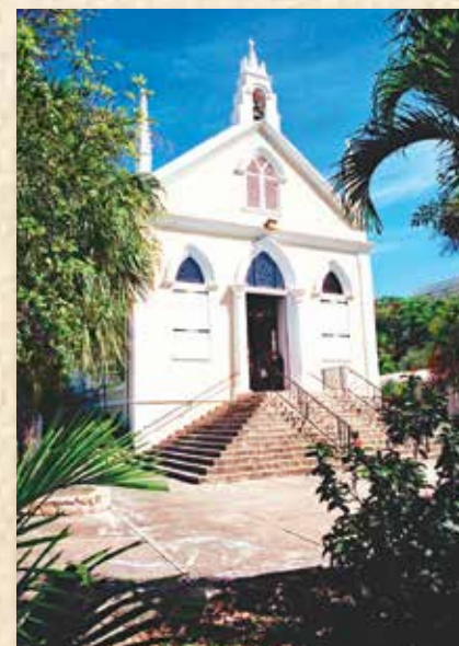
Holy Cross Catholic Church, St. Croix