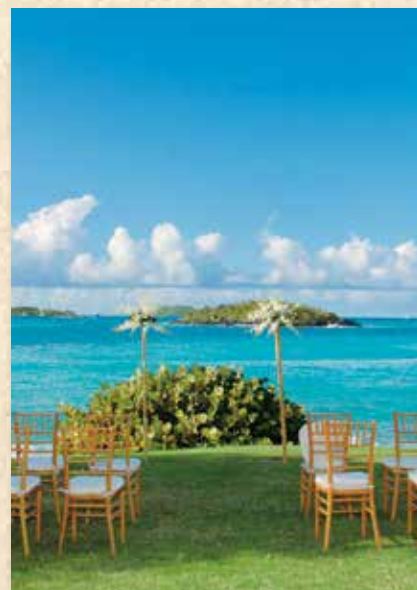
Caneel Bay Resort, St. John